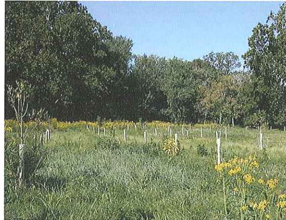
Streamside buffer planting (CP22)