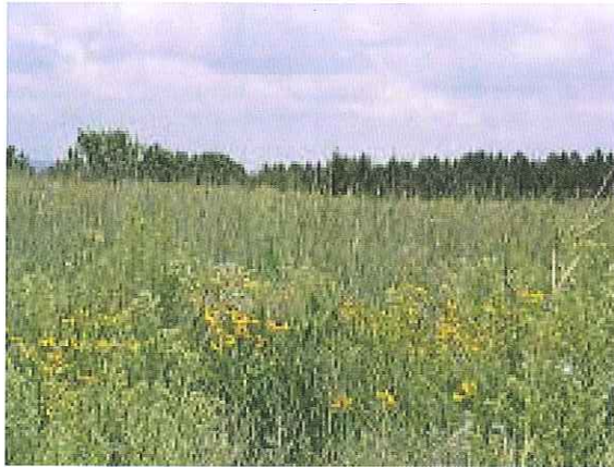
Native warm-season grass planting (CP2)